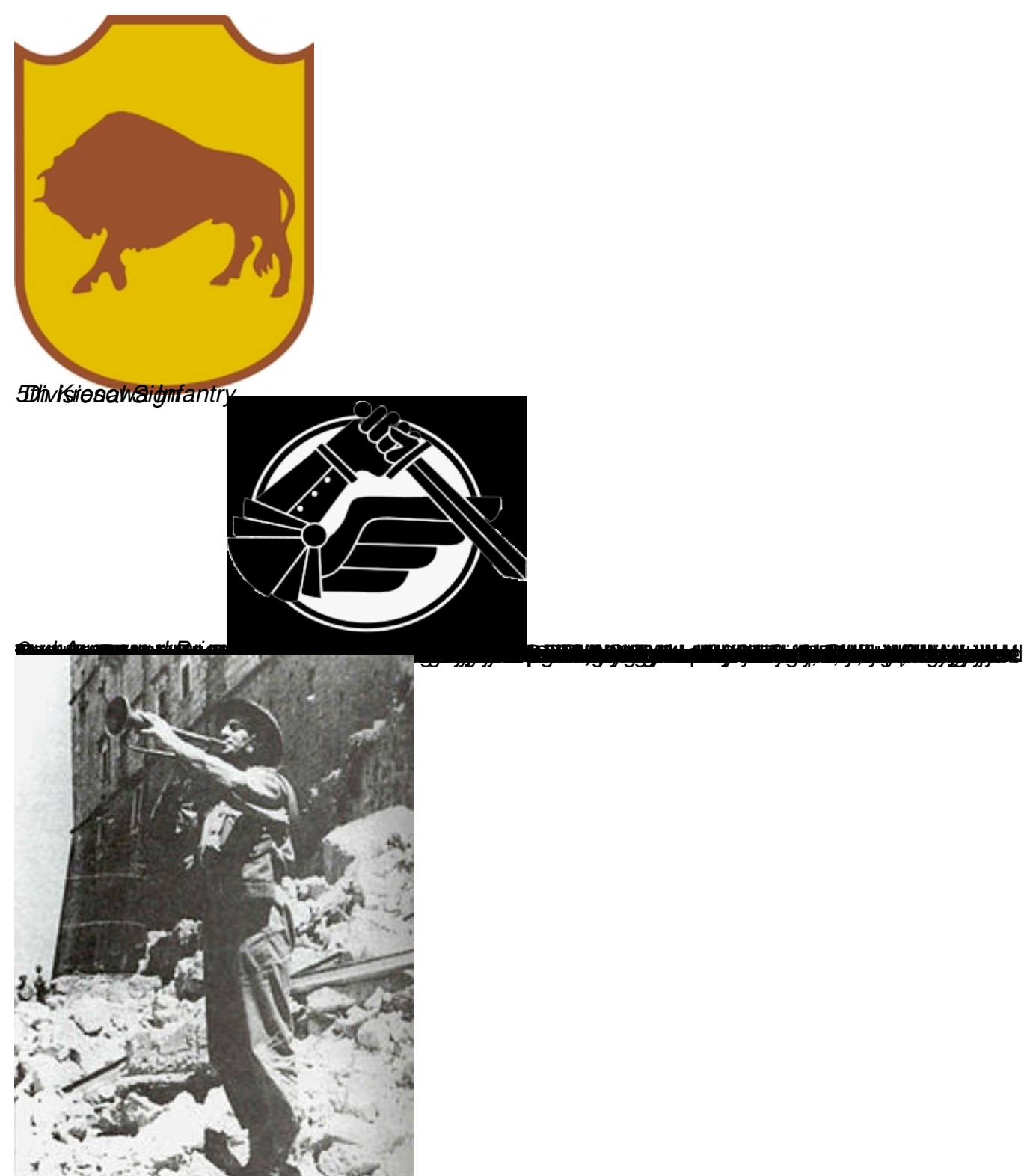
Prollingh noingleat scassing he Last Post

Written by Administrator Monday, 14 April 2014 12:00 - Last Updated Thursday, 17 April 2014 08:40