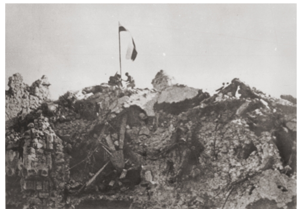
The Polish flag flies above the ruins of Monte Cassino, Italy, 18 May 1944.

In July 1945 the British government withdrew recognition of the Polish Government in Exile (a government that had been housed in London since 1939 supporting the cause of freedom for the world and for Poland) and went on to then recognize the Russian backed government in Poland. As if this was not an insult and shock enough for the Poles who had fought so bravely and given so much in the fight against Nazi Germany, the British, under pressure from Russia, went on to at first refuse Polish forces permission to march in the Victory Parade in London and then try to placate them with a partial presence which of course they did not accept - not even the brave surviving Poles of the RAF squadrons who had played such a vital part in the Battle of Britain - a tragic and forgotten smear on our past. This left the British with just one more problem - what to do with the large Polish Army still camped in Italy. The choices were to send them back to Poland - where thousands would undoubtedly be executed as the 14,000 Polish officers and intellectuals had been at Katyn in May 1940 by the Russians - or to assimilate them in Britain. It was decided to take the latter option - no doubt through necessity as certainly many Poles would have refused to return to a now Russian controlled Poland, a Poland they had fought to free from Nazism and now saw handed to the Russians on a plate.